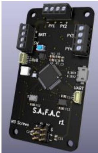
Fig 2 – SAFAC (Second Attempt at Flight Aviation Computer)